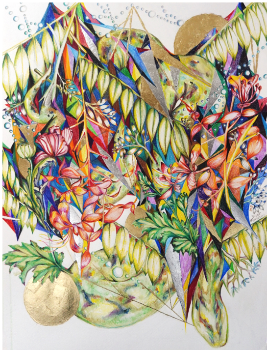
Soe Yu Nwe, Pride of Burma and Green Burmese Python , watercolour and colour pencil on Canson Heritage paper, gold and silver leaf, adhesive, 76 x 56cm, 2024

Opening Reception: Saturday 18 th January 2025, 3-6pm