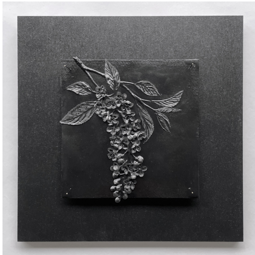
Annette Marie Townsend, Flight of the Bumblebees (Black Series), Bird Cherry , wax and paper sculpture. (mounted in a 5 sided Perspex cover with painted MDF backboard), 25 x 25 x 6cm, 2024

karin weber gallery Contemporary Fine Art